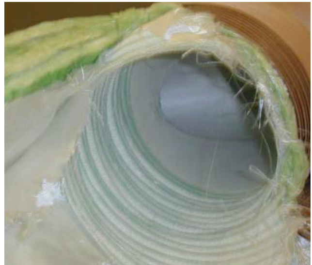
Figure 3: Unused air supply ducting [7].

Figure 3 shows a section of the interior surface of an unused air supply duct of a bleed air aircraft that is free from particulate material [7].