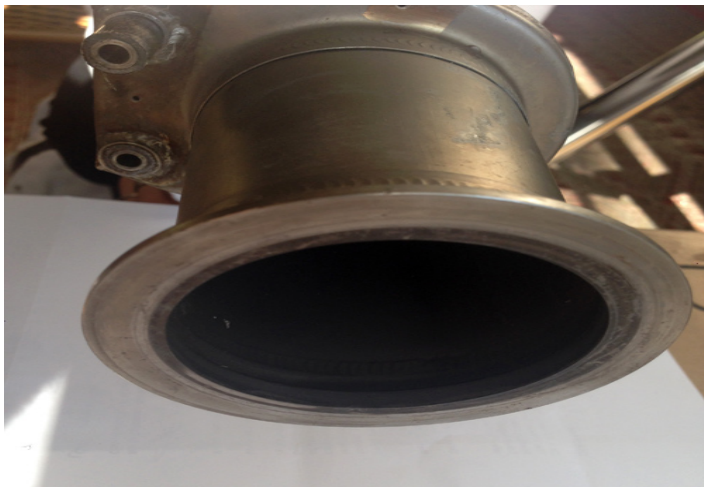
Figure 1: Air supply ducting of a B737 aircraft [35].

Figure 1 shows the air supply ducting of a Boeing B737 bleed air system aircraft. Note the blackened appearance of the ducting.