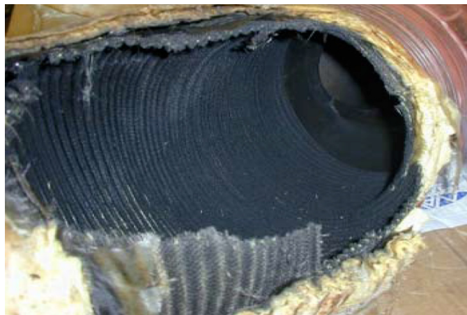
Figure 4: Used aircraft air supply ducting [7].